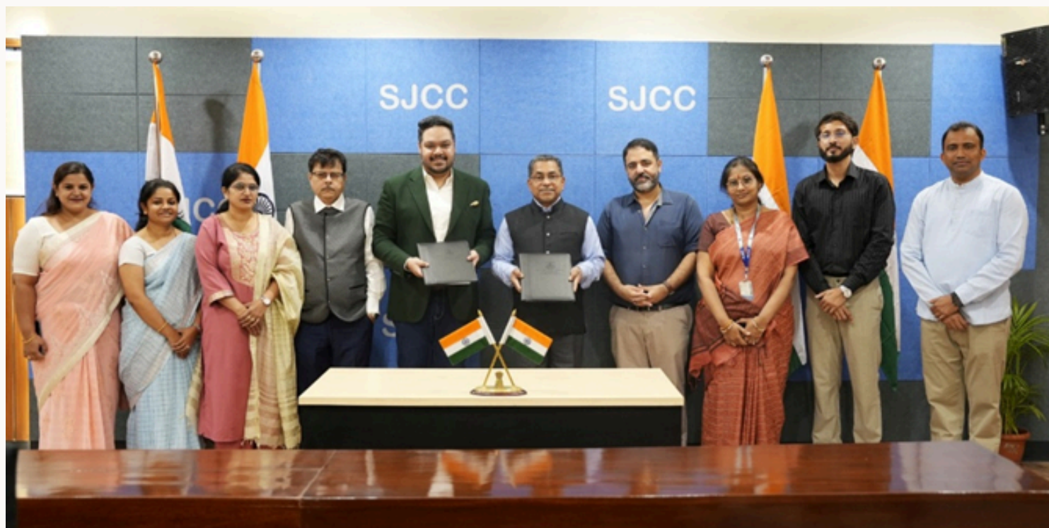
MOU- SJCC & J.K. Shah Classes

The SJCC Research Centre, in collaboration with the Ministry of MSME, Government of India, organised a Seven-Day National-Level Experiential Workshop on Research Methodology from 1 to 7 December 2025. The Internal Quality Assurance Cell (IQAC) organized a Two-Day National Seminar on “Fostering Innovation, Inclusion and Sustainability in Higher Education Institutions” on 15 and 16 December 2025, sponsored by the ICSSR – Southern Regional Centre. The seminar deliberated on contemporary challenges and transformative practices shaping higher education.