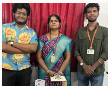
Department of ECE, secured the 19th rank among over 1000 project ideas - their project, titled "Marutham Care", was recognized by the Tamil Nadu Skill Development Corporation (TNSDC)